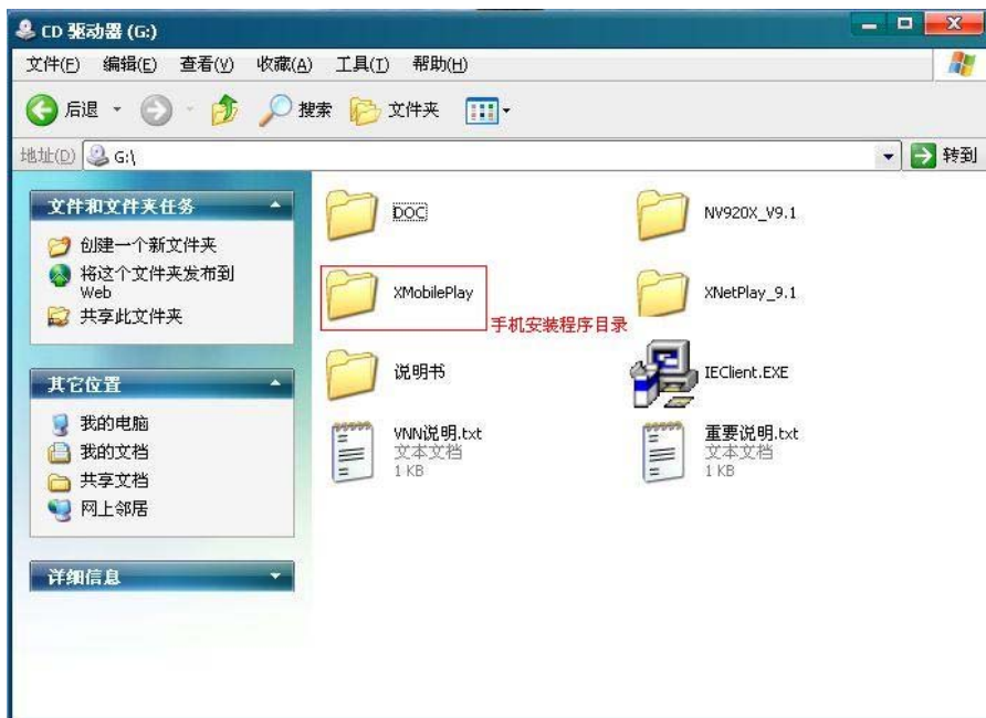
CD Root of DVR Card

Open the CD of this DVR Card . Clip the file XMobilePlay, there are two sub-files. XMobilePlay_CHS.jar is a Chinese version, and XMobilePlay_En.jar is an English version . Choose a right one as you need.