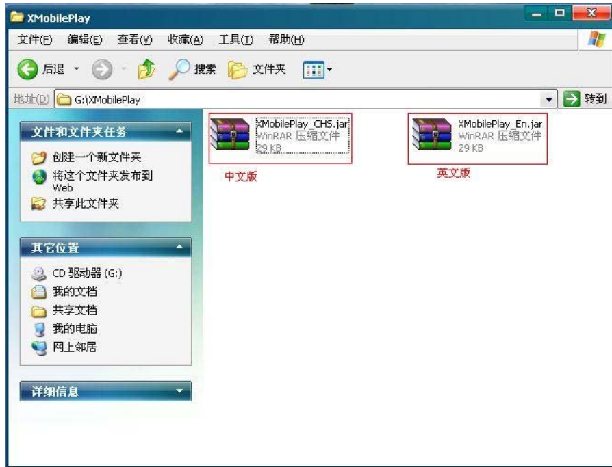
Two version clients for mobile